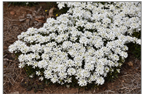
Snowsation Candytuft in bloom

We are so proud of the nursery stock that we have carefully selected for superior quality and performance, WE GUARANTEE ALL TREES, SHRUBS, EVERGREENS FOR 2 YEARS, AND ROSES FOR 1 YEAR!