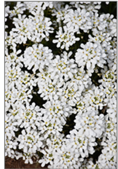
Snowsation Candytuft flowers

Snowsation Candytuft is recommended for the following landscape applications;