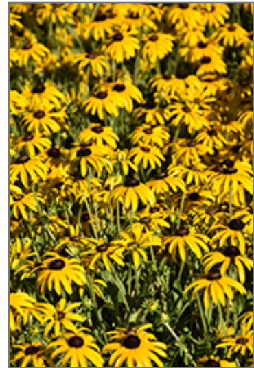
American Gold Rush Coneflower flowers

American Gold Rush Coneflower is a fine choice for the garden, but it is also a good selection for planting in outdoor pots and containers. With its upright habit of growth, it is best suited for use as a 'thriller' in the 'spiller-thriller-filler' container combination; plant it near the center of the pot, surrounded by smaller plants and those that spill over the edges. Note that when growing plants in outdoor containers and baskets, they may require more frequent waterings than they would in the yard or garden. Be aware that in our climate, most plants cannot be expected to survive the winter if left in containers outdoors, and this plant is no exception. Contact our experts for more information on how to protect it over the winter months.