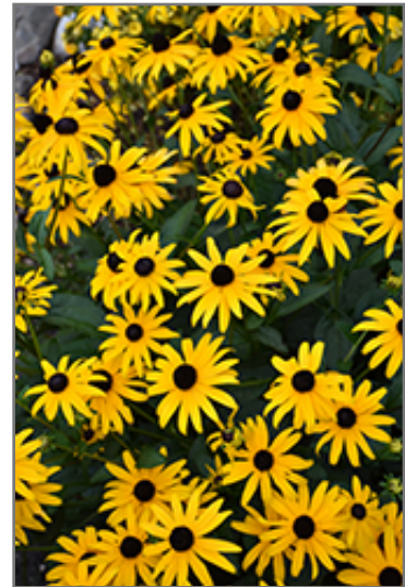
American Gold Rush Coneflower flowers

American Gold Rush Coneflower is an herbaceous perennial with an upright spreading habit of growth. Its medium texture blends into the garden, but can always be balanced by a couple of finer or coarser plants for an effective composition.