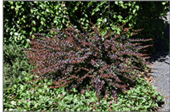
Lava Nugget Barberry

Lava Nugget Barberry is a dense multi-stemmed deciduous shrub with a more or less rounded form. Its relatively fine texture sets it apart from other landscape plants with less refined foliage.