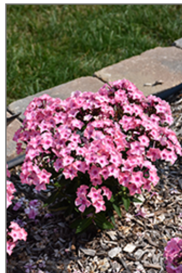
Sweet Summer Queen Garden Phlox in bloom

We are so proud of the nursery stock that we have carefully selected for superior quality and performance, WE GUARANTEE ALL TREES, SHRUBS, EVERGREENS FOR 2 YEARS, AND ROSES FOR 1 YEAR!