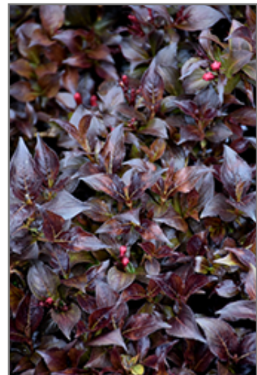
Coco Krunch Weigela foliage

We are so proud of the nursery stock that we have carefully selected for superior quality and performance, WE GUARANTEE ALL TREES, SHRUBS, EVERGREENS FOR 2 YEARS, AND ROSES FOR 1 YEAR!