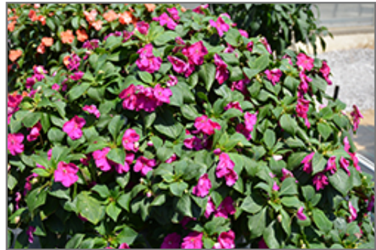
Beacon Violet Shades Impatiens in bloom