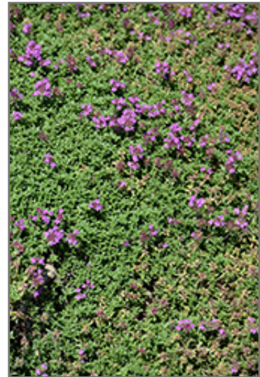
Creeping Thyme in bloom

Creeping Thyme is a dense herbaceous evergreen perennial with a ground-hugging habit of growth. It brings an extremely fine and delicate texture to the garden composition and should be used to full effect.