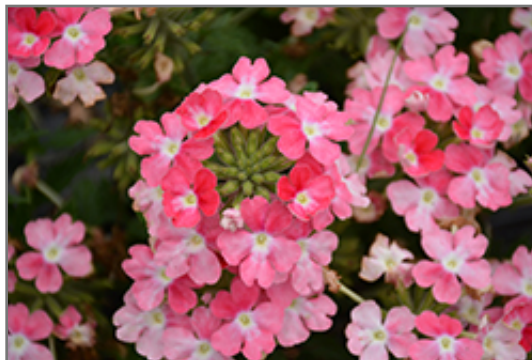
EnduraScape Pink Fizz Verbena flowers

This plant will require occasional maintenance and upkeep. Trim off the flower heads after they fade and die to encourage more blooms late into the season. Deer don't particularly care for this plant and will usually leave it alone in favor of tastier treats. It has no significant negative characteristics.