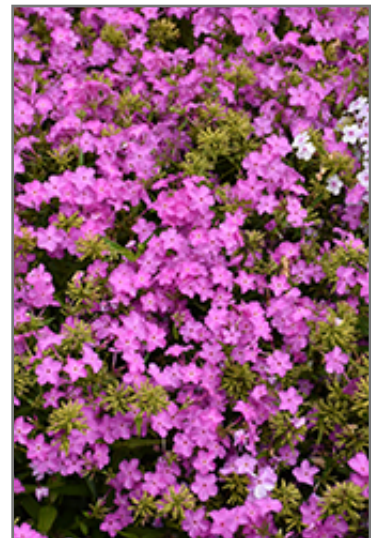
Opening Act Ultrapink Phlox flowers

We are so proud of the nursery stock that we have carefully selected for superior quality and performance, WE GUARANTEE ALL TREES, SHRUBS, EVERGREENS FOR 2 YEARS, AND ROSES FOR 1 YEAR!