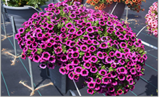
Superbells Blackcurrent Punch Calibrachoa in bloom

We are so proud of the nursery stock that we have carefully selected for superior quality and performance, WE GUARANTEE ALL TREES, SHRUBS, EVERGREENS FOR 2 YEARS, AND ROSES FOR 1 YEAR!