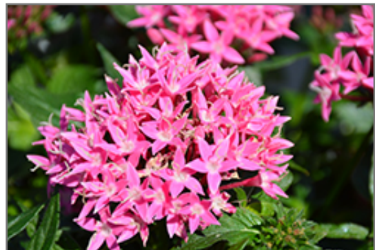
Lucky Star Deep Pink Star Flower flowers

We are so proud of the nursery stock that we have carefully selected for superior quality and performance, WE GUARANTEE ALL TREES, SHRUBS, EVERGREENS FOR 2 YEARS, AND ROSES FOR 1 YEAR!