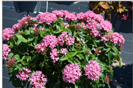
Lucky Star Deep Pink Star Flower in bloom