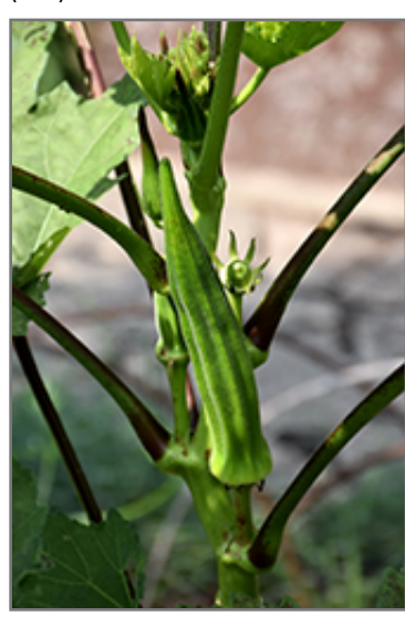
Okra fruit

Okra will grow to be about 4 feet tall at maturity, with a spread of 3 feet. When planted in rows, individual plants should be spaced approximately 18 inches apart. Because of its vigorous growth habit, it may require staking or supplemental support. This fast-growing vegetable plant is an annual, which means that it will grow for one season in your garden and then die after producing a crop.