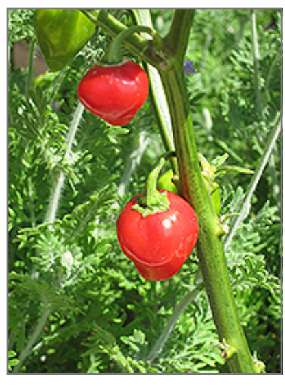
Caribbean Red Pepper fruit