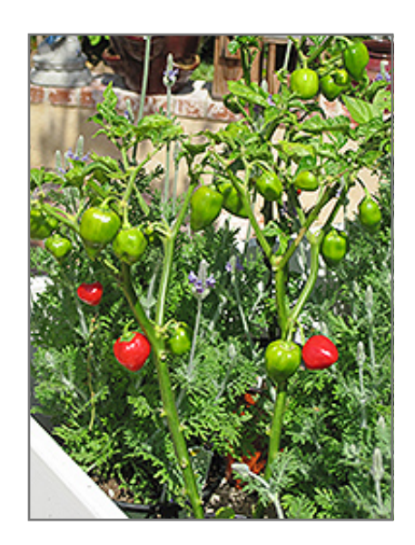
Caribbean Red Pepper