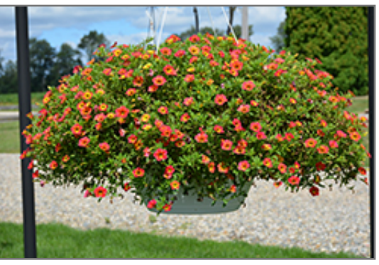
Cabaret Diva Orange Calibrachoa in bloom