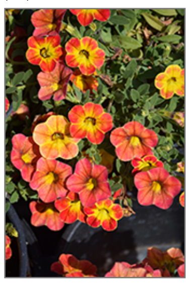
Cabaret Diva Orange Calibrachoa flowers

Cabaret Diva Orange Calibrachoa is a dense herbaceous annual with a trailing habit of growth, eventually spilling over the edges of hanging baskets and containers. Its medium texture blends into the garden, but can always be balanced by a couple of finer or coarser plants for an effective composition.