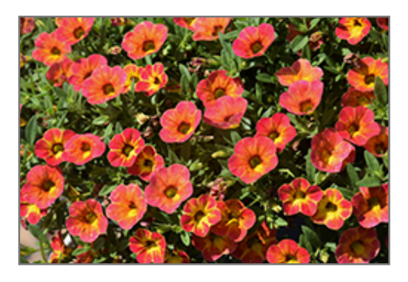
Cabaret Diva Orange Calibrachoa flowers