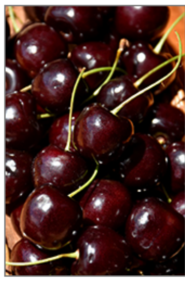
Lapins Cherry fruit

Lapins Cherry is draped in stunning clusters of fragrant white flowers hanging below the branches in early spring before the leaves. It has dark green deciduous foliage. The pointy leaves turn yellow in fall. The fruits are showy red drupes which fade to black over time, which are carried in abundance in early summer. The fruit can be messy if allowed to drop on the lawn or walkways, and may require occasional clean-up. The smooth dark red bark adds an interesting dimension to the landscape.