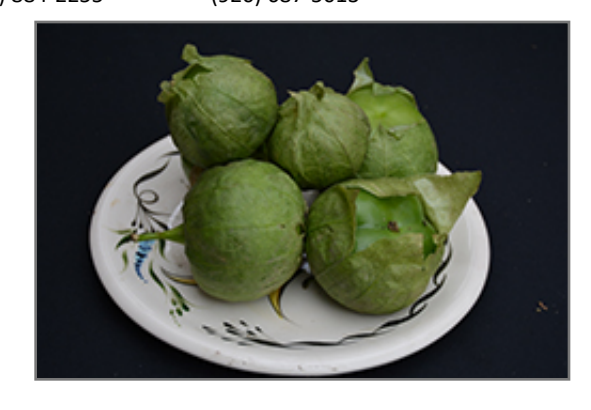
Tomatillo fruit

Tomatillo will grow to be about 5 feet tall at maturity, with a spread of 3 feet. When planted in rows, individual plants should be spaced approximately 3 feet apart. Because of its vigorous growth habit, it may require staking or supplemental support. This fast-growing vegetable plant is an annual, which means that it will grow for one season in your garden and then die after producing a crop.