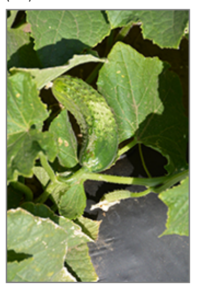
Bush Pickle Cucumber fruit

Bush Pickle Cucumber will grow to be about 24 inches tall at maturity, with a spread of 4 feet. When planted in rows, individual plants should be spaced approximately 12 inches apart. This fast-growing vegetable plant is an annual, which means that it will grow for one season in your garden and then die after producing a crop.