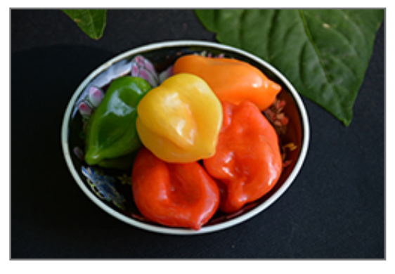
Trinidad Scorpion Hot Pepper fruit