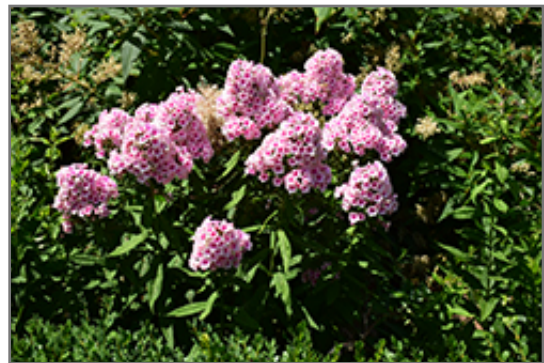
Bright Eyes Garden Phlox in bloom

We are so proud of the nursery stock that we have carefully selected for superior quality and performance, WE GUARANTEE ALL TREES, SHRUBS, EVERGREENS FOR 2 YEARS, AND ROSES FOR 1 YEAR!