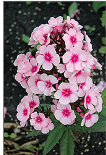
Bright Eyes Garden Phlox flowers

Bright Eyes Garden Phlox is a fine choice for the garden, but it is also a good selection for planting in outdoor pots and containers. With its upright habit of growth, it is best suited for use as a 'thriller' in the 'spiller-thriller-filler' container combination; plant it near the center of the pot, surrounded by smaller plants and those that spill over the edges. It is even sizeable enough that it can be grown alone in a suitable container. Note that when growing plants in outdoor containers and baskets, they may require more frequent waterings than they would in the yard or garden. Be aware that in our climate, most plants cannot be expected to survive the winter if left in containers outdoors, and this plant is no exception. Contact our experts for more information on how to protect it over the winter months.