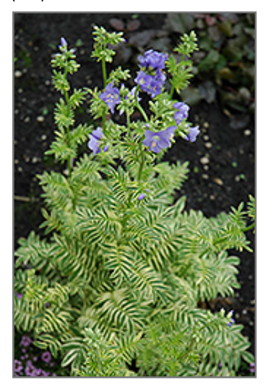
Brise D'Anjou Jacob's Ladder in bloom

Brise D'Anjou Jacob's Ladder has masses of beautiful spikes of sky blue flowers rising above the foliage from mid spring to mid summer, which are most effective when planted in groupings. The flowers are excellent for cutting. Its attractive ferny pinnately compound leaves remain green in color with showy creamy white variegation throughout the season.