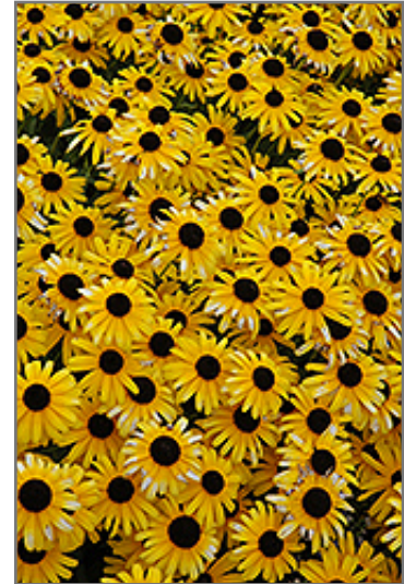
Viette's Little Suzy Coneflower flowers

Viette's Little Suzy Coneflower is recommended for the following landscape applications;