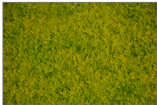
Scotch Moss foliage

We are so proud of the nursery stock that we have carefully selected for superior quality and performance, WE GUARANTEE ALL TREES, SHRUBS, EVERGREENS FOR 2 YEARS, AND ROSES FOR 1 YEAR!