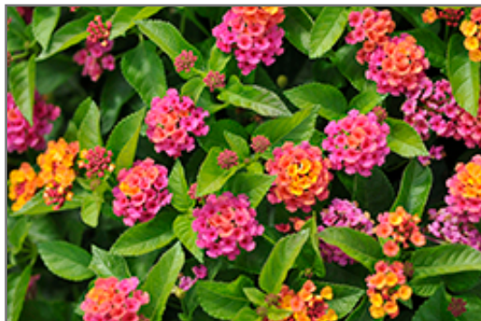
Bloomify Rose Lantana flowers

Bloomify Rose Lantana is a multi-stemmed annual with a mounded form. Its medium texture blends into the garden, but can always be balanced by a couple of finer or coarser plants for an effective composition.