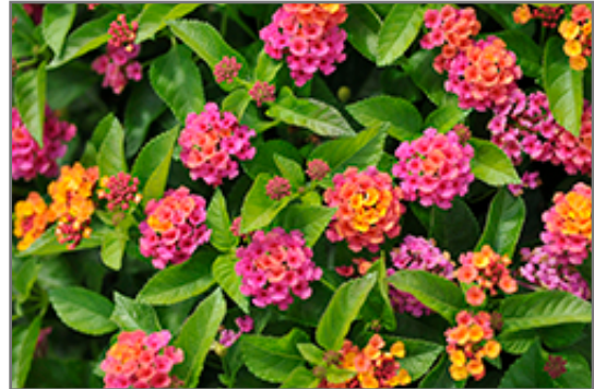
Bloomify Rose Lantana flowers

Bloomify Rose Lantana is a multi-stemmed annual with a mounded form. Its medium texture blends into the garden, but can always be balanced by a couple of finer or coarser plants for an effective composition.