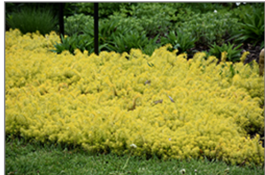
Angelina Stonecrop

Angelina Stonecrop will grow to be about 8 inches tall at maturity, with a spread of 12 inches. When grown in masses or used as a bedding plant, individual plants should be spaced approximately 10 inches apart. Its foliage tends to remain low and dense right to the ground. It grows at a fast rate, and under ideal conditions can be expected to live for approximately 10 years. As an herbaceous perennial, this plant will usually die back to the crown each winter, and will regrow from the base each spring. Be careful not to disturb the crown in late winter when it may not be readily seen!