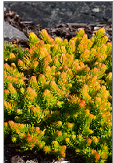
Angelina Stonecrop foliage

Angelina Stonecrop is recommended for the following landscape applications;