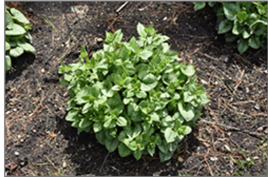
Jack of Diamonds Bugloss

Jack of Diamonds Bugloss will grow to be about 14 inches tall at maturity, with a spread of 30 inches. When grown in masses or used as a bedding plant, individual plants should be spaced approximately 28 inches apart. It grows at a medium rate, and under ideal conditions can be expected to live for approximately 10 years. As an herbaceous perennial, this plant will usually die back to the crown each winter, and will regrow from the base each spring. Be careful not to disturb the crown in late winter when it may not be readily seen!