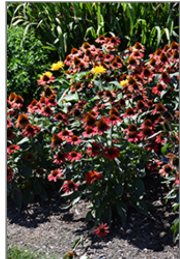
Color Coded Frankly Scarlet Coneflower in bloom

We are so proud of the nursery stock that we have carefully selected for superior quality and performance, WE GUARANTEE ALL TREES, SHRUBS, EVERGREENS FOR 2 YEARS, AND ROSES FOR 1 YEAR!