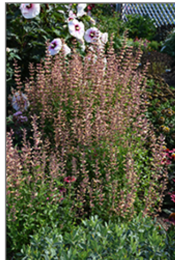
Meant To Bee Queen Nectarine Anise Hyssop in bloom

Meant To Bee Queen Nectarine Anise Hyssop is a fine choice for the garden, but it is also a good selection for planting in outdoor pots and containers. With its upright habit of growth, it is best suited for use as a 'thriller' in the 'spiller-thriller-filler' container combination; plant it near the center of the pot, surrounded by smaller plants and those that spill over the edges. It is even sizeable enough that it can be grown alone in a suitable container. Note that when growing plants in outdoor containers and baskets, they may require more frequent waterings than they would in the yard or garden. Be aware that in our climate, most plants cannot be expected to survive the winter if left in containers outdoors, and this plant is no exception. Contact our experts for more information on how to protect it over the winter months.