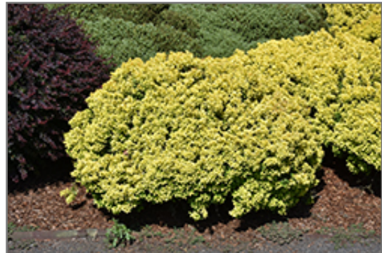
Golden Nugget Japanese Barberry

We are so proud of the nursery stock that we have carefully selected for superior quality and performance, WE GUARANTEE ALL TREES, SHRUBS, EVERGREENS FOR 2 YEARS, AND ROSES FOR 1 YEAR!