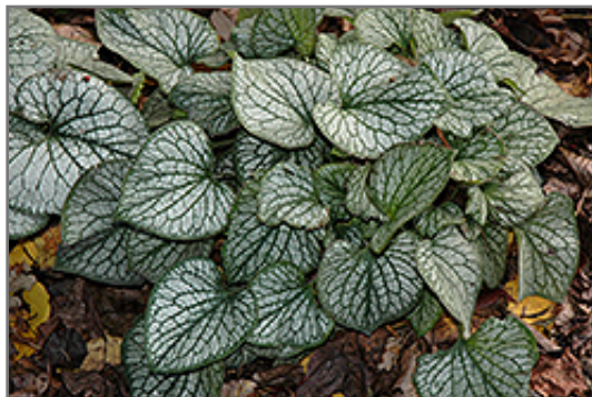
Jack Frost Bugloss foliage

Jack Frost Bugloss is an herbaceous perennial with a mounded form. Its relatively coarse texture can be used to stand it apart from other garden plants with finer foliage.