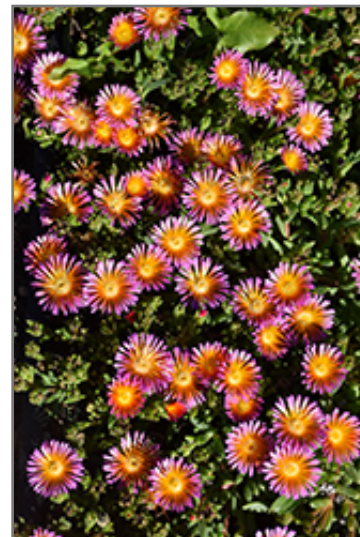
Ocean Sunset Orange Glow Ice Plant flowers

Ocean Sunset Orange Glow Ice Plant is a fine choice for the garden, but it is also a good selection for planting in outdoor pots and containers. Because of its spreading habit of growth, it is ideally suited for use as a 'spiller' in the 'spiller-thriller-filler' container combination; plant it near the edges where it can spill gracefully over the pot. Note that when growing plants in outdoor containers and baskets, they may require more frequent waterings than they would in the yard or garden. Be aware that in our climate, most plants cannot be expected to survive the winter if left in containers outdoors, and this plant is no exception. Contact our experts for more information on how to protect it over the winter months.