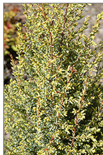
Gold Cone Juniper foliage

We are so proud of the nursery stock that we have carefully selected for superior quality and performance, WE GUARANTEE ALL TREES, SHRUBS, EVERGREENS FOR 2 YEARS, AND ROSES FOR 1 YEAR!