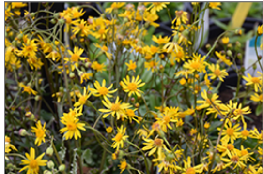
Golden Ragwort flowers