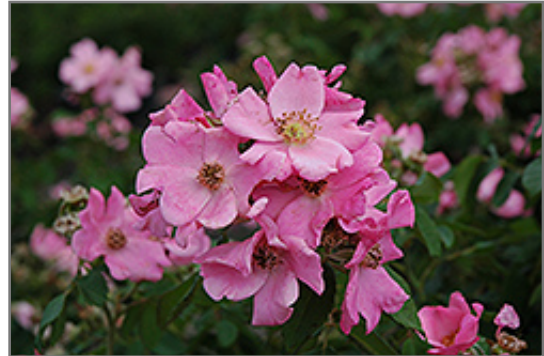
Polar Joy Rose flowers

Polar Joy Rose is a deciduous shrub, selected and trained to grow in a small tree-like form with the primary plant grafted high atop a standard. Its average texture blends into the landscape, but can be balanced by one or two finer or coarser trees or shrubs for an effective composition.