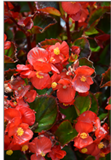
Ambassador Scarlet Begonia flowers

Ambassador Scarlet Begonia is an herbaceous annual with a mounded form. Its medium texture blends into the garden, but can always be balanced by a couple of finer or coarser plants for an effective composition.