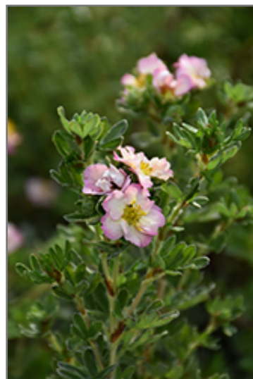
Happy Face Hearts Potentilla flowers

We are so proud of the nursery stock that we have carefully selected for superior quality and performance, WE GUARANTEE ALL TREES, SHRUBS, EVERGREENS FOR 2 YEARS, AND ROSES FOR 1 YEAR!