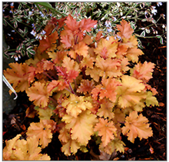
Marmalade Coral Bells foliage

Marmalade Coral Bells will grow to be about 8 inches tall at maturity extending to 18 inches tall with the flowers, with a spread of 16 inches. When grown in masses or used as a bedding plant, individual plants should be spaced approximately 14 inches apart. Its foliage tends to remain low and dense right to the ground. It grows at a medium rate, and under ideal conditions can be expected to live for approximately 10 years. As an evegreen perennial, this plant will typically keep its form and foliage year-round.