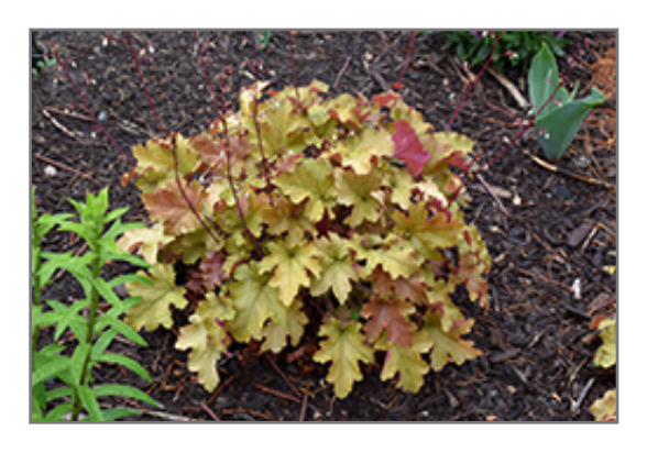
Marmalade Coral Bells