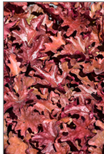
Peach Flambe Coral Bells foliage

Peach Flambe Coral Bells is a dense herbaceous evergreen perennial with tall flower stalks held atop a low mound of foliage. Its relatively fine texture sets it apart from other garden plants with less refined foliage.