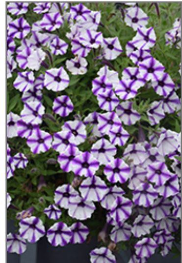
Supertunia Mini Vista Violet Star Petunia flowers

Supertunia Mini Vista Violet Star Petunia is a dense herbaceous annual with a trailing habit of growth, eventually spilling over the edges of hanging baskets and containers. Its medium texture blends into the garden, but can always be balanced by a couple of finer or coarser plants for an effective composition.