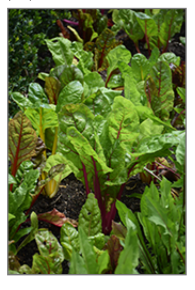
Swiss Chard

Swiss Chard will grow to be about 18 inches tall at maturity, with a spread of 14 inches. When planted in rows, individual plants should be spaced approximately 12 inches apart. This fast-growing vegetable plant is an annual, which means that it will grow for one season in your garden and then die after producing a crop. Because of its relatively short time to maturity, it lends itself to a series of successive plantings each staggered by a week or two; this will prolong the effective harvest period.