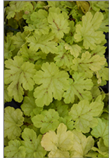
Spicy Lime Foamy Bells foliage

This is a relatively low maintenance plant, and should be cut back in late fall in preparation for winter. It is a good choice for attracting hummingbirds to your yard. It has no significant negative characteristics.