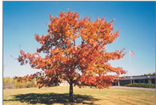
Red Oak in fall