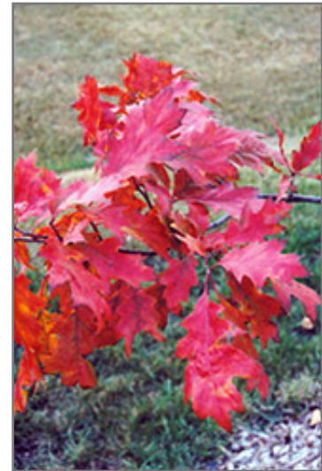
Red Oak in fall

This tree should only be grown in full sunlight. It prefers to grow in average to moist conditions, and shouldn't be allowed to dry out. It is not particular as to soil type, but has a definite preference for acidic soils, and is subject to chlorosis (yellowing) of the leaves in alkaline soils. It is highly tolerant of urban pollution and will even thrive in inner city environments. This species is native to parts of North America.