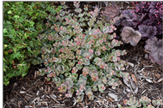
October Daphne