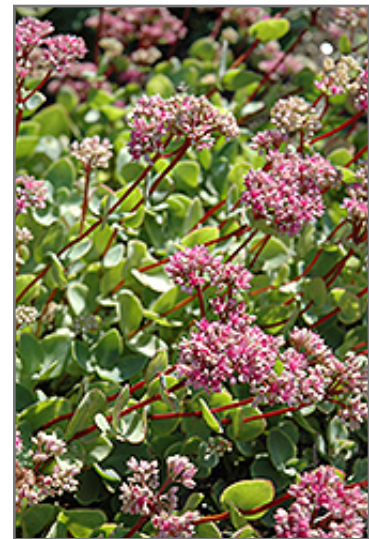
October Daphne flowers

October Daphne is recommended for the following landscape applications;