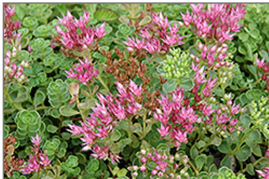
John Creech Stonecrop flowers