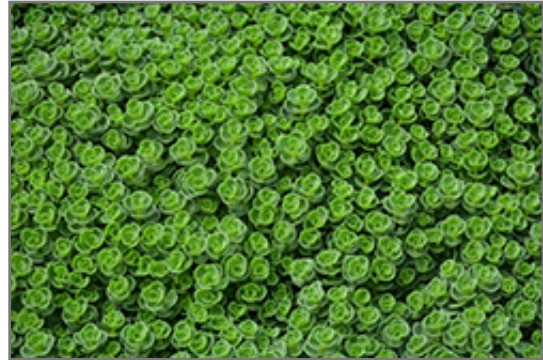
John Creech Stonecrop foliage

John Creech Stonecrop is a fine choice for the garden, but it is also a good selection for planting in outdoor pots and containers. Because of its spreading habit of growth, it is ideally suited for use as a 'spiller' in the 'spiller-thriller-filler' container combination; plant it near the edges where it can spill gracefully over the pot. Note that when growing plants in outdoor containers and baskets, they may require more frequent waterings than they would in the yard or garden. Be aware that in our climate, most plants cannot be expected to survive the winter if left in containers outdoors, and this plant is no exception. Contact our experts for more information on how to protect it over the winter months.