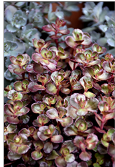
Voodoo Stonecrop foliage

Voodoo Stonecrop is recommended for the following landscape applications;