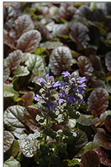
Purple Brocade Bugleweed flowers