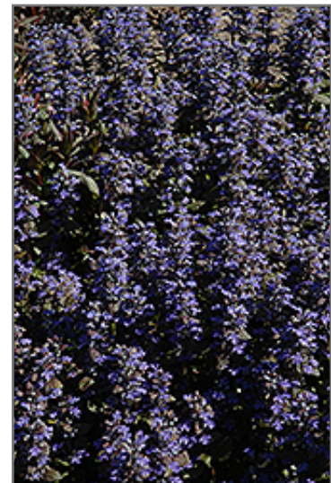
Purple Brocade Bugleweed flowers

We are so proud of the nursery stock that we have carefully selected for superior quality and performance, WE GUARANTEE ALL TREES, SHRUBS, EVERGREENS FOR 2 YEARS, AND ROSES FOR 1 YEAR!