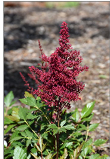
Red Sentinel Astilbe flowers

Red Sentinel Astilbe is a fine choice for the garden, but it is also a good selection for planting in outdoor pots and containers. With its upright habit of growth, it is best suited for use as a 'thriller' in the 'spiller-thriller-filler' container combination; plant it near the center of the pot, surrounded by smaller plants and those that spill over the edges. Note that when growing plants in outdoor containers and baskets, they may require more frequent waterings than they would in the yard or garden. Be aware that in our climate, most plants cannot be expected to survive the winter if left in containers outdoors, and this plant is no exception. Contact our experts for more information on how to protect it over the winter months.