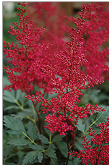
Red Sentinel Astilbe flowers

This is a relatively low maintenance plant, and is best cleaned up in early spring before it resumes active growth for the season. It is a good choice for attracting butterflies to your yard, but is not particularly attractive to deer who tend to leave it alone in favor of tastier treats. It has no significant negative characteristics.