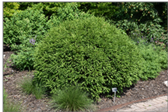
Green Gem Boxwood

We are so proud of the nursery stock that we have carefully selected for superior quality and performance, WE GUARANTEE ALL TREES, SHRUBS, EVERGREENS FOR 2 YEARS, AND ROSES FOR 1 YEAR!