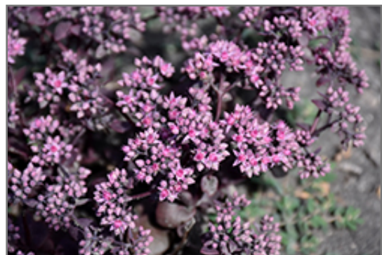
Red Carpet Stonecrop flowers

We are so proud of the nursery stock that we have carefully selected for superior quality and performance, WE GUARANTEE ALL TREES, SHRUBS, EVERGREENS FOR 2 YEARS, AND ROSES FOR 1 YEAR!