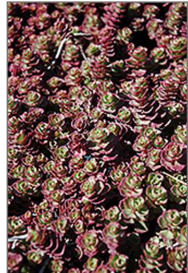
Red Carpet Stonecrop foliage

Red Carpet Stonecrop is a dense herbaceous perennial with a ground-hugging habit of growth. It brings an extremely fine and delicate texture to the garden composition and should be used to full effect.