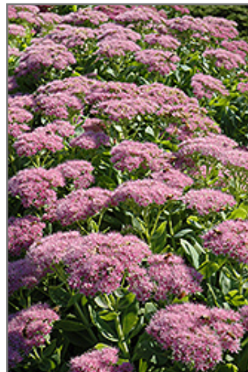
Brilliant Stonecrop flowers

This is a relatively low maintenance plant, and is best cleaned up in early spring before it resumes active growth for the season. It is a good choice for attracting bees and butterflies to your yard, but is not particularly attractive to deer who tend to leave it alone in favor of tastier treats. It has no significant negative characteristics.