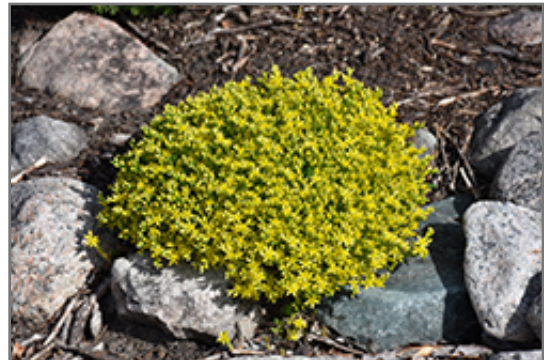
Golden Moss Stonecrop in bloom